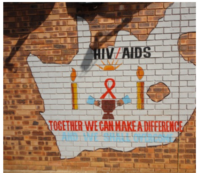
Painted on the wall at Nchuncheko Primary. Finally, it is talked about!

When I did my first care package delivery to the schools, I was extremely sad to learn that AFnetAid had to cut the feeding program to one whole school. Last year, we were feeding orphans at three schools: Kondelelani, Nchuncheko, and St. Francis. With the hard economic times around the world, many of AFnetAid's sponsors were dropping out. With a large decrease in monthly financial support, difficult decisions had to be made. AFnetAid chose to honor the commitments made to the orphans that were taken into the orphan day care centers - how do you put a child back on the street after you have taken them in?! The heartbreaking decision was made to stop bringing care packages to St. Francis School. 115 child-headed orphan families are no longer getting a package of food each month.